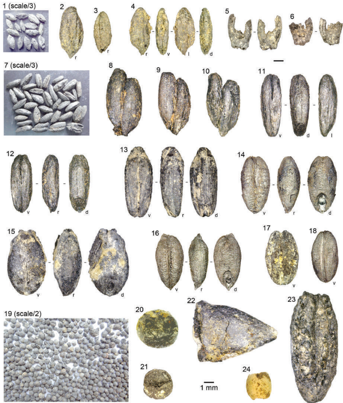
Figure 4. Archaeobotanical findings from the Boian culture and Gumelnița culture contexts of the Hârșova-Tell archaeological site (by R. Hovsepyan). 1-4 – charred grains of einkorn, 2-3 – single grained einkorn ( Triticum monococcum ), 4 – Timopheev’s wheat ( Triticum timopheevii ), 5 – spikelet base of einkorn, 6 – spikelet base of Timopheev’s wheat, 7-12 – charred grains of emmer ( Triticum dicoccum ), 8-10 – grains from the same spikelets, which stayed attached after glumes of spikelets were gone, 13 – charred grain of spelta wheat ( Triticum aestivum ssp. spelta ), 14-18 – charred grains of naked barley ( Hordeum vulgare var. nudum ), 19 – charred seeds of bitter vetch ( Vicia ervilia ), 20 – charred seed of common pea ( Pisum sativum ), 21 – charred seed of lentil ( Lens culinaris ), 22 – charred part of water caltrop ( Trapa natans ) nut, 23 – charred nutstone of cornelian cherry ( Cornus mas ), 24 – biomineralized nutlet of Lithospermum purpureocaeruleum graven on the top and in the bottom to make a bead. Cultural belonging: 1-13, 15, 17, 20-24 – Boian (exc. 2013), 14, 16, 18-19 – Gumelnița (exc. 2014) (Location of specimens: 1-4 – SC/pP, St. 20, US 20646, SL 109, D3; 5-6 – SC pP, St. 20, US 20246, C 2065, B3; 7-12 – SC/pP, St. 20, US 20646, SL 109, C3-D3; 13 – SC/pP, St. 20, US 20247, C 2065, C1; 14, 16, 18 – S 1 V, US 30036; 15, 17, 20-22, 24 – SC/pP, St. 20, US 20170, C 2065, D1; 19 – S 1 V, US 30045; 23 – SC/pP, St. 20, US 20246, C 2065, A1).