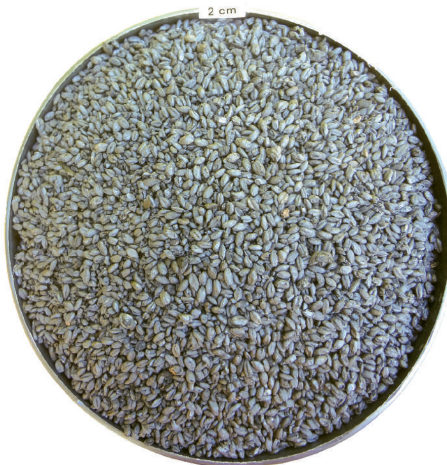
Figure 5. Charred grain mass of naked barley ( Hordeum vulgare var. nudum ) from the Hârșova-Tell settlement (Gumelnița culture; exc. 2014, S 1 V, US 30036; by R. Hovsepyan).

Although none of the cultivated plants, wild plants, or weeds recently recovered in Hârșova-Tell are new for the Chalcolithic or Neolithic period of Romania 12 , there are some new records of cultivated plants for the Boian cultural occupation of this settlement: naked barley ( Hordeum vulgare var. nudum ), bitter vetch ( Vicia ervilia ), lentil ( Lens culinaris ) and Timopheev's wheat ( Triticum timopheevii ) (see Table 1 for the details, the new records are marked with “*”). The hackberry ( Celtis sp.) and an essential part of the weedy species are new records for the Gumelnița cultural occupations of the Hârșova-Tell settlement (Tab. 2, the new records are marked with “*”).