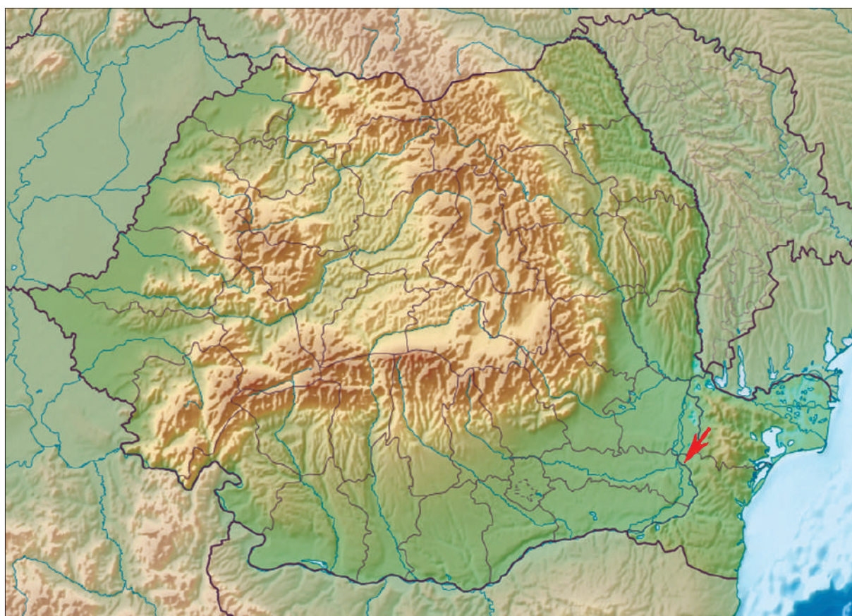
Figure 1. Location of Hârșova-Tell on the map of Romania.

Archaeological excavations at the Hârșova-Tell site started in 1961, conducted by D. Galbenu 1 , and continued to the present day with some interruptions. The first excavations (a test trench in the central part of the tell ) evinced the existence of archaeological remains attributed to the last three phases of the Boian cultural evolution and two of the three stages of the Gumelnița culture's evolution (Gumelnița A1 and A2). Starting in 1993, the excavation (ca. 400 m 2 ) strategy changed (director of excavations was Dr. Dragomir-Nicolae Popovici 2 ) to permit a better understanding of the evolution of this exceptional site with a very complicated stratigraphy. It allowed the testing of the informational content of different types of the discovered stratigraphic units (inside or outside dwellings and occupations (marked as US), refuse from different fire contexts, etc.), allowing the elaboration of a specific sampling strategy appropriate for every discipline involved in the multidisciplinary research. The space of the settlement has been organized with buildings of the same dimensions built one after another and having passageways between, which demonstrates the presence of a highly organized community 3 .